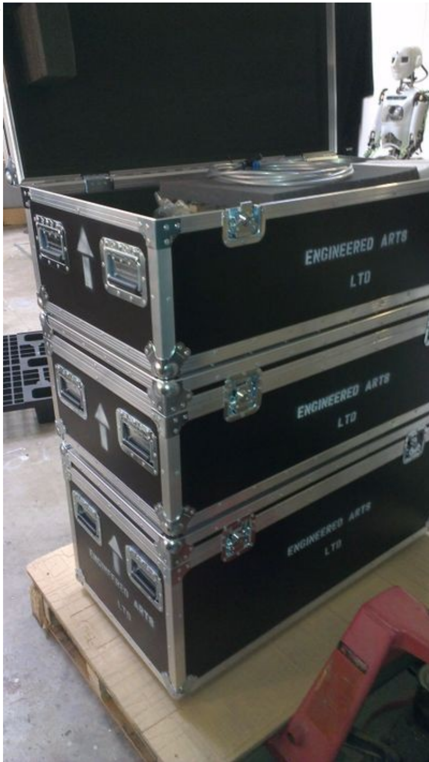
Flight cases stacked