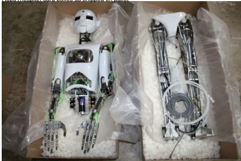
RoboThespian Torso and Legs boxes opened

Typical dimensions and weight: RoboThespian and Kiosk, no compressor