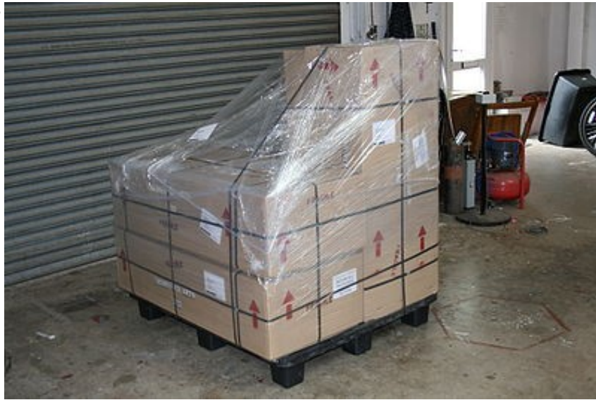
RoboThespian card boxes as shipped on pallet