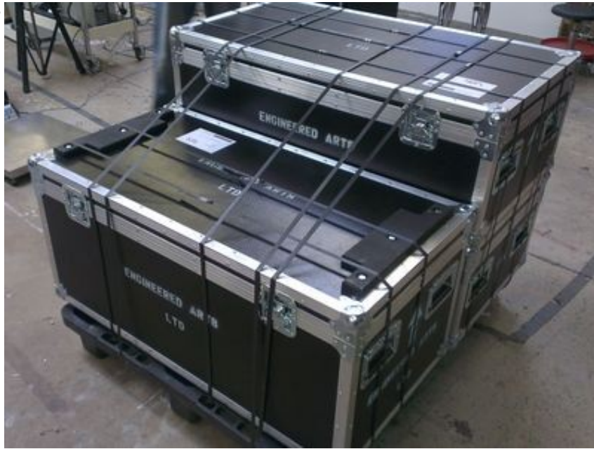
RoboThespian Torso Legs and Kiosk flightcases