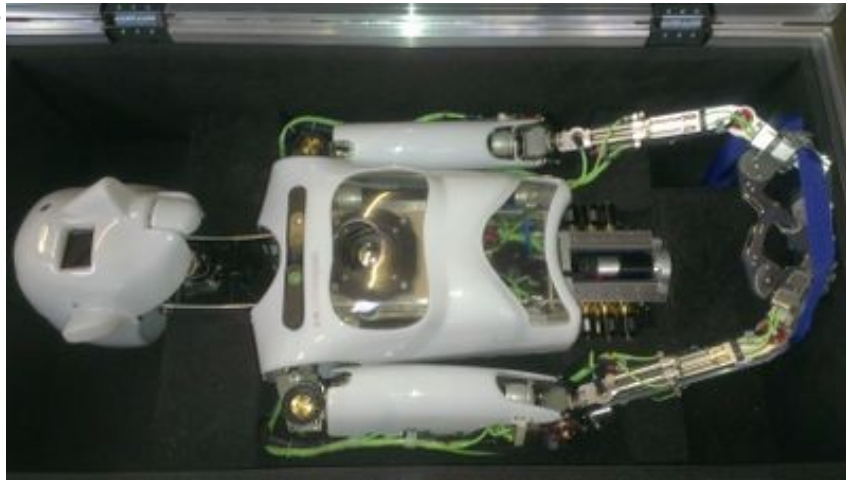
Torso flight case open

Typical dimensions and weight: RoboThespian and kiosk in 3 flight cases strapped to pallet