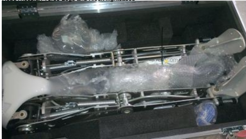
Legs flight case open