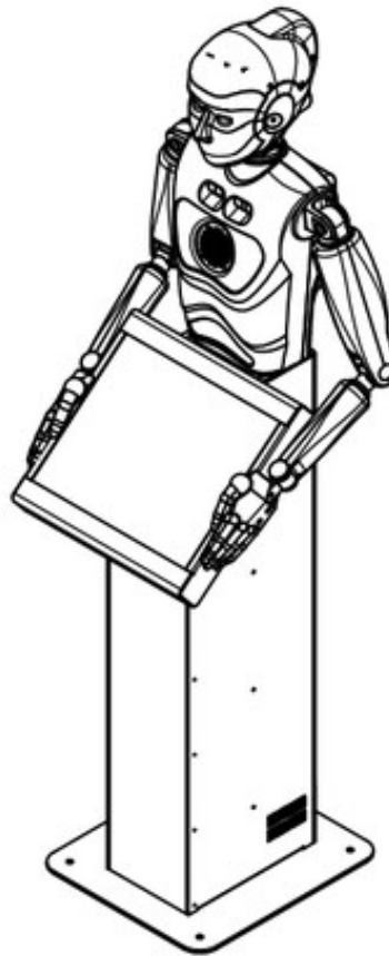
SociBot Kiosk Overall Dimensions